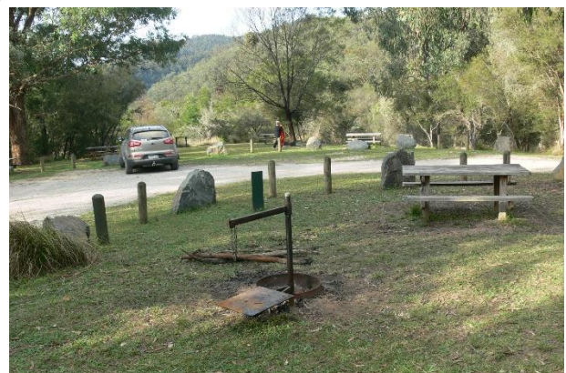
Balley Hooley day use