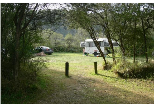
Balley Hooley camping area