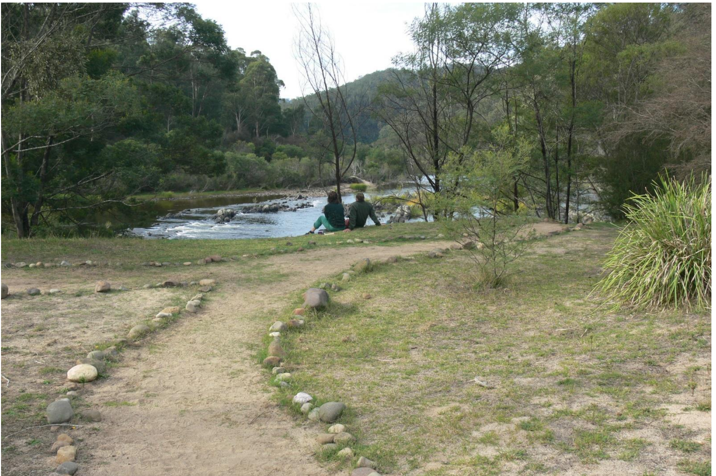
Junction of Buchan Rv and Snowy Rv at Balley Hooley